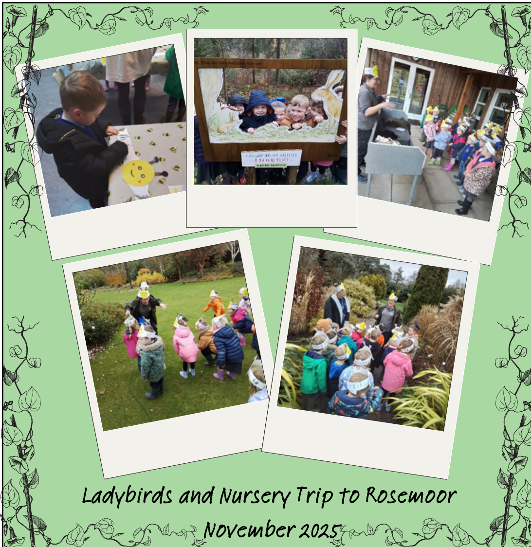
Ladybirds and Nursery Trip to Rosemoor