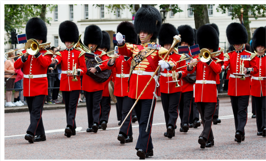
military marching band

A marching band is a group of musicians who perform their music while they are marching. They usually play brass, woodwind and percussion instruments. The musicians often wear a uniform and perform in parades or at special events. They usually march in lines and are led by a conductor. They work together to keep in time and follow the beat of the music.