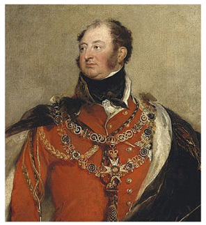
Portrait of Prince Frederick

The Grand Old Duke of York is thought to be about Prince Frederick, Duke of York and Albany, who was the second son of King George III. In 1794, Frederick was asked to lead a huge army against the French. Frederick was not a good leader, and he lost the battle. Frederick decided to learn how to be a better leader. He worked hard, and his army went on to win many battles.